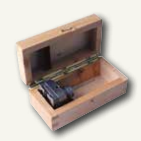
Measuring probe, Macro