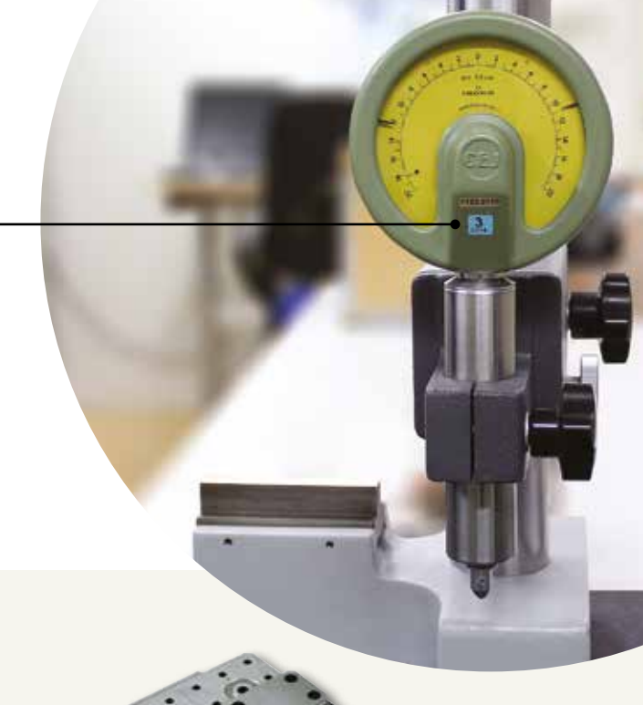
Examples of calibration tools in our service programme