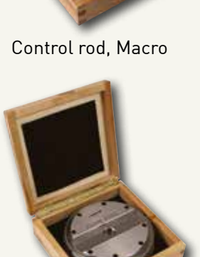
Control ruler, MacroMagnum