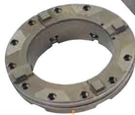
D-30212 Chuck, Matrix 142

For more info ask your local System 3R dealer.