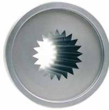
Example of produced detail